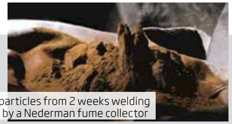
Airborne particles from 2 weeks welding captured by a Nederman fume collector

One single welder produces 20-40 g fumes per hour, which corresponds to about 35-70 kg per year.