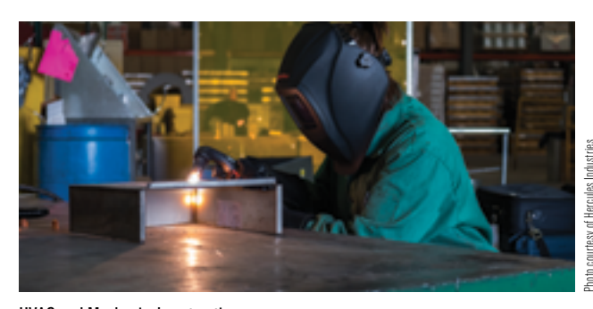
HVAC and Mechanical contracting

Property/plant maintenance, fire and rescue, general fabrication, plus: